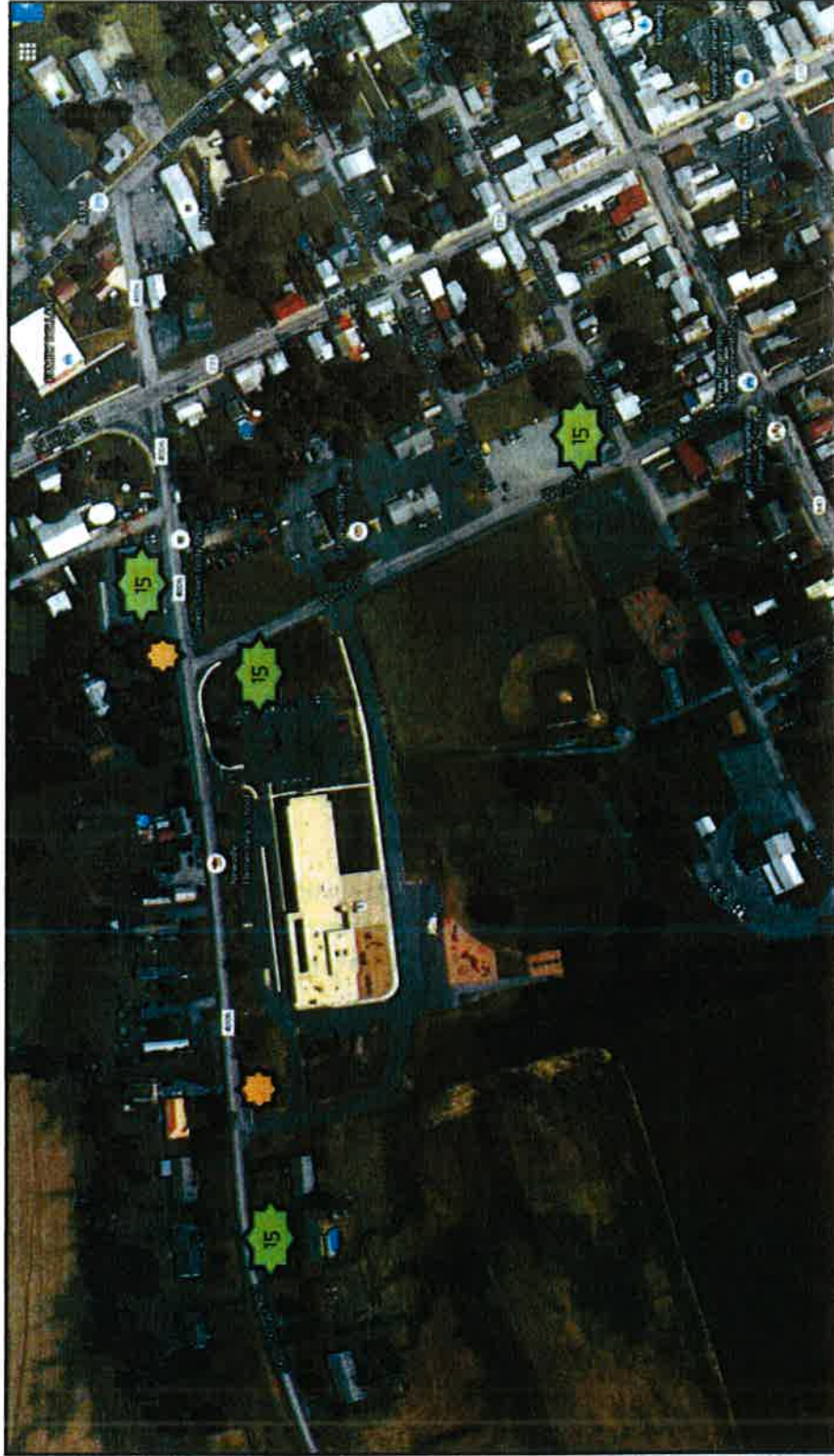
EXHIBIT "A" STUDY AREA 1